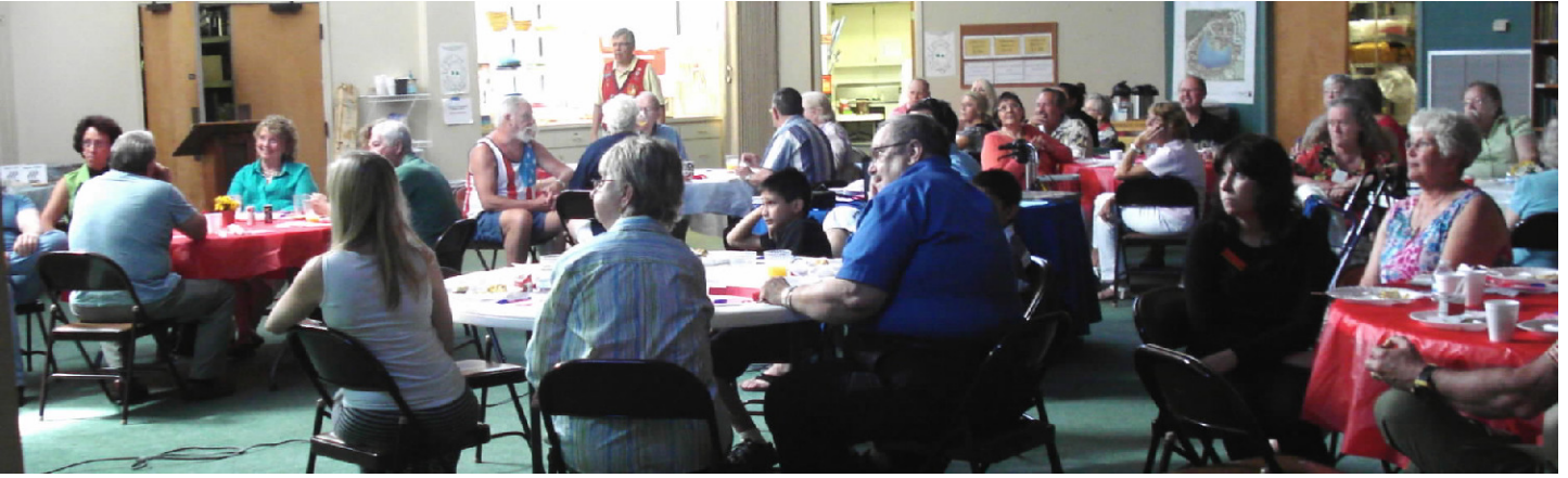
June 8 Lodge New Member Welcome Brunch