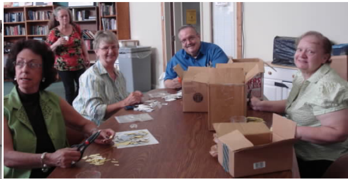
Lodge members trimmed cancelled stamps to send to Norway for Tubfrim.